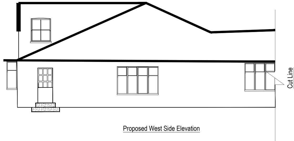
Proposed West Side Elevation